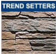
Formosa Manufactured Stone Siding - Chocolate